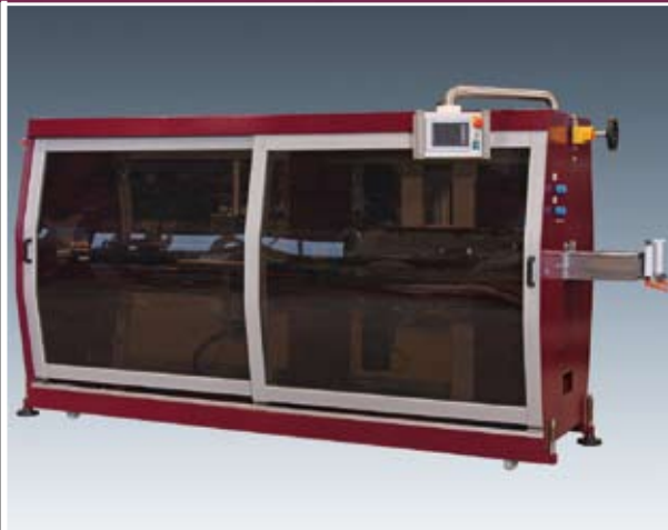
01 Belt puller/Saw module-S