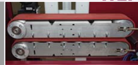
02 Belt carrier

EBP-Beltpuller-4KN_20m/min-module-S - to Pull the extruded profile