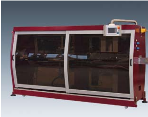
01 Cleat puller/Saw module-S

ECPS-Cleatpuller-/Saw-8KN_15m/min-module-S - to Pull/Cut the extruded profile