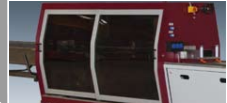
Lines 8KN_15m/min module _ Calibration table