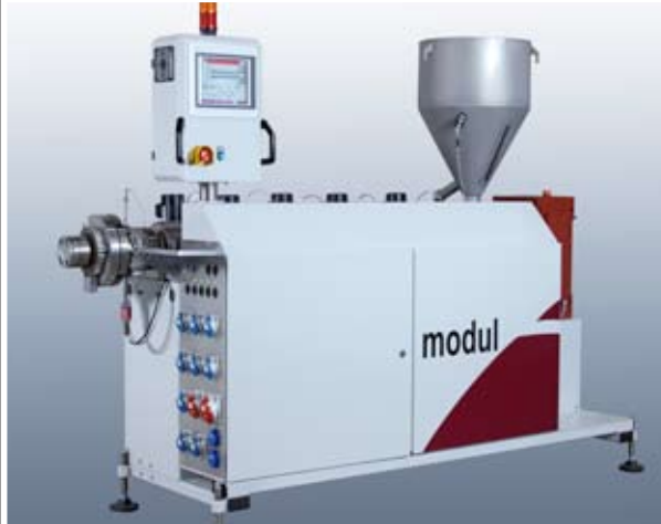
Lines 8KN_15m/min module _ Extruder